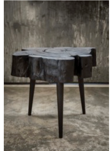
Burnt Trunk Table